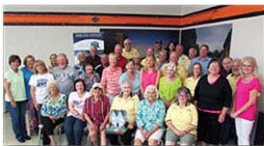
High Plains Thunderbirds with Martha's Home staff and board members.

The High Plains Thunderbirds do appreciate recognition of our efforts, but it is we as a club and as individuals that greatly appreciate and support Martha's Home, its staff and directors for the love and hard work that each of them put forth to make Martha's Home the successful organization that it is.